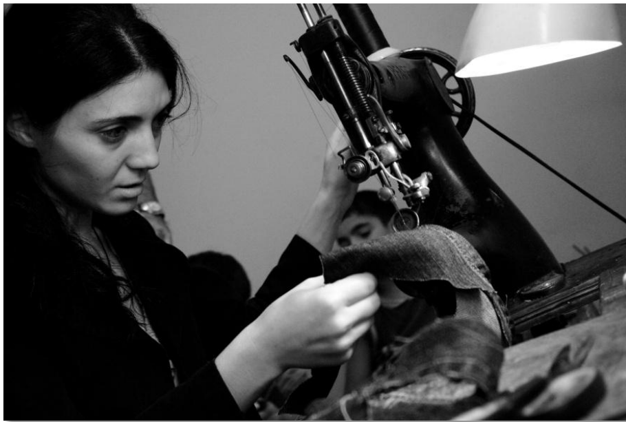
Shoe making workshop

indarokle@gmail.com <> http://indarokle.com/ <> http://romanito-on-the-road.blogspot.com