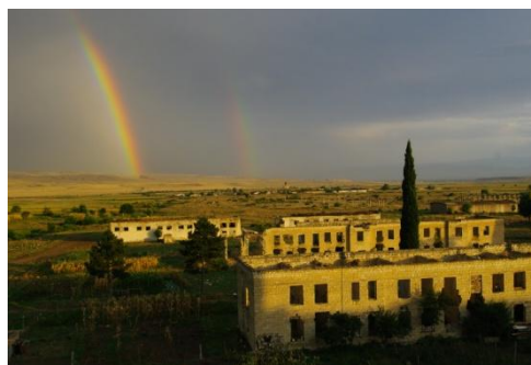
View from our window

There is one bar in Koda. Very small, very original. There is offer of draught beer, local chacha (brandy) and some food. Unfortunately bar was closing in the afternoon and it was totally closed in October. And in general, there is not much to do in Koda. People usually gather outside (Koda boulevard:-) When the weather was good we enjoyed evening walking around, talking to people and in general just being there. After while people got to know that we are there. But I had the feeling that we still have to explain that we are not tourist and what is our job (that we are not teachers as everybody usually expect). We were in contact with locals. What will always stay in my mind is shouting of little kids “Hallo” and “Good bye” – it means whole their vocabulary☺