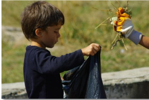
Clean-up action Koda