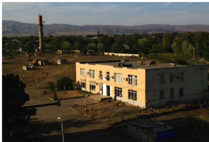
Koda Community Education Centre 2011

GLEN internship was held in village Koda in Eastern Georgia not far from capital Tbilisi. Our work lasted from September to December 2011. German – Czech tandem was composed of Eva and Roman. Three months were filled up by work for Koda Community Education Centre. Our main task was to work with Youth Club of the Centre but we were also involved in both regular and irregular activities of the Koda Community Education Centre. Half of the village of Koda which has approximately 3000 inhabitants consists of IDPs (Internally Displaced Persons). These IDPs had to leave South Ossetia during the war in 2008 and were resettled to Koda. KodaCommunity Education Centre was established because of their arrival. Centres goal is their socio-economic integration into new environment. There is possibility to attend several vocational courses in the Centre, become a member of the Youth Club, small business consultancies are provided.