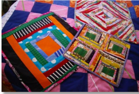
Made in Koda