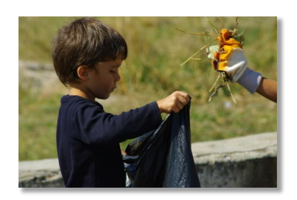
Clean-up action Koda