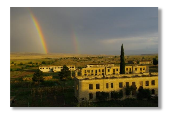
View from our window

There is one bar in Koda. Very small, very original. There is offer of draught beer, local chacha (brandy) and some food. Unfortunately bar was closing in the afternoon and it was totally closed in October. And in general, there is not much to do in Koda. People usualy gather outside (Koda boulevard:-) When the weather was good we enjoyed evening walking around, talking to people and in general just being there. After while people got to know that we are there. But I had the feeling that we still have to explain that we are not tourist and what is our job (that we are not teachers as everybody usualy expect). We were in contact with locals. What will always stay in my mind is shouting of little kids "Hallo" and "Good bye" – it means whole their vocabulary: