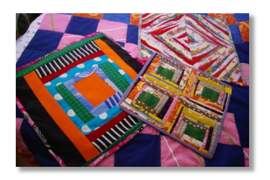
Made in Koda