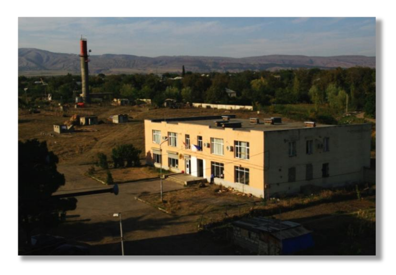
Koda Community Education Centre 2011

GLEN internship was held in village Koda in Eastern Georgia not far from capital Tbilisi. Our work lasted from September to December 2011. German – Czech tandem was composed of Eva and Roman. Three months were filled up by work for Koda Community Education Centre. Our main task was to work with Youth Club of the Centre but we were also involved in both regular and irregular activities of the Koda Community Education Centre. Half of the village of Koda which has approximately 3000 inhabitants consists of IDPs (Internally Displaced Persons). These IDPs had to leave South Ossetia during the war in 2008 and were resetled to Koda. KodaCommunity Education Centre was established because of their arrival. Centres goal is their socio-economic integration into new environment. There is possibility to attend several vocational courses in the Centre, become a member of the Youth Club, small business consultancies are provided.