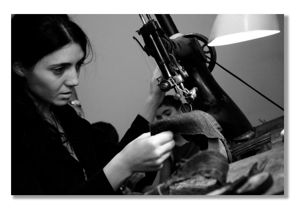
Shoe making workshop

indarokle@gmail.com <> http://indarokle.com/ <> http://romanito-on-the-road.blogspot.com