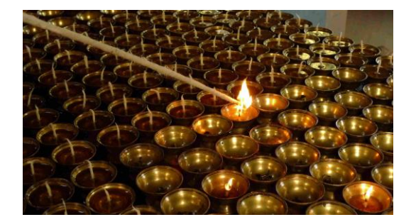
Butter lamps in the Buddhist temple in Bodh Gaya

a conference on engaged Buddhism in Bodh Gaya, Bihar. We could attend the conference and visit one of the most important Buddhist places in India.