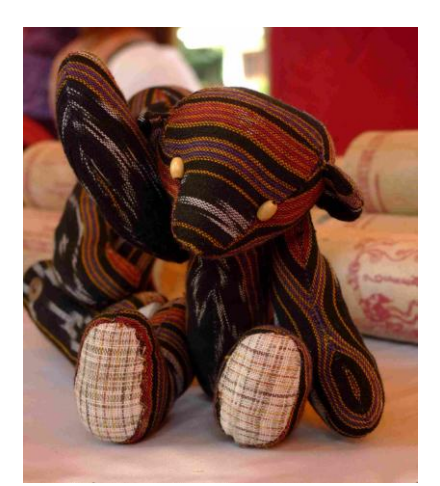
Teddy bear made in Deer Park out of recycled material

On a personal level I think I might say the internship brought me a better understanding of how I work under pressure of different managerial and hierarchical structures. It showed to me how important is flexibility in working and living conditions. I can say that even my knowledge base has been improved - be it the zero waste approach and implementing it on an institutional policy level, getting a glimpse on organising and financing self-help groups in Indian context or getting familiar with various alternative educational approaches. There has been a lot!