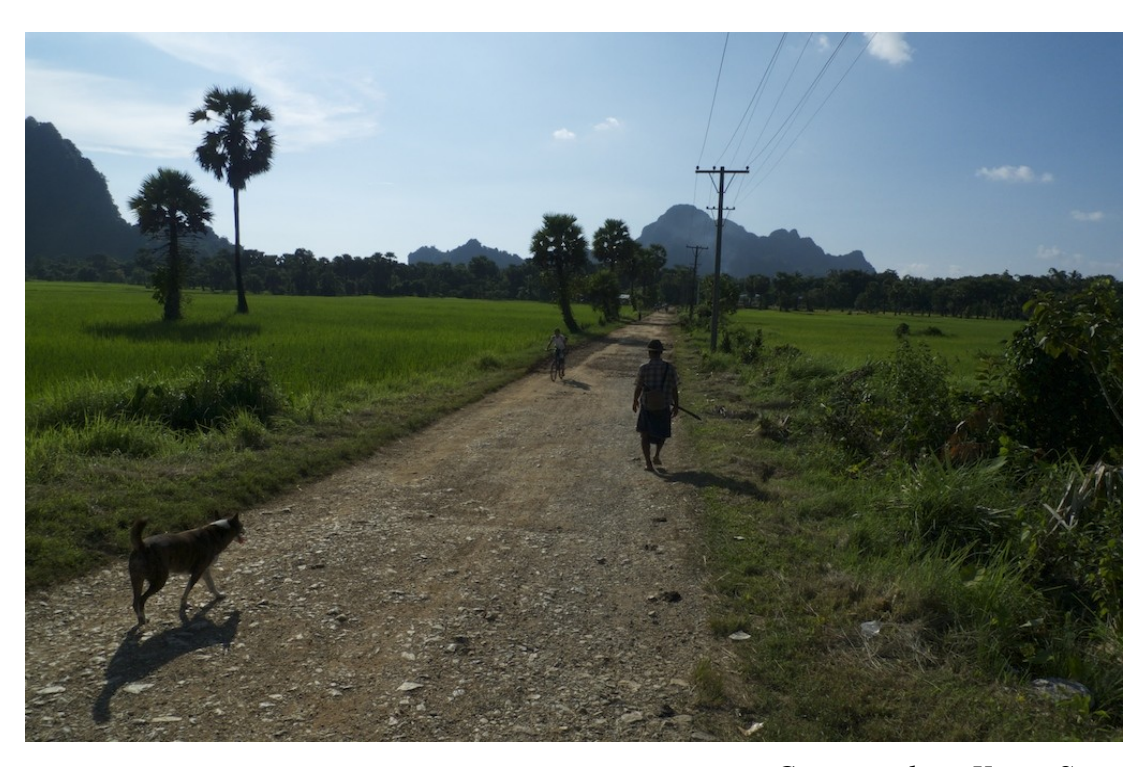
Countryside in Karen State

During my internship I have fallen in love with Myanmar and its people although I can also see that I have been very lucky with the people I met and I worked with and that this impression is a result of the time when I was there. The country is changing rapidly these days and I'm afraid that the charm of this far-off country not destroyed by tourism might be away in a couple of years.