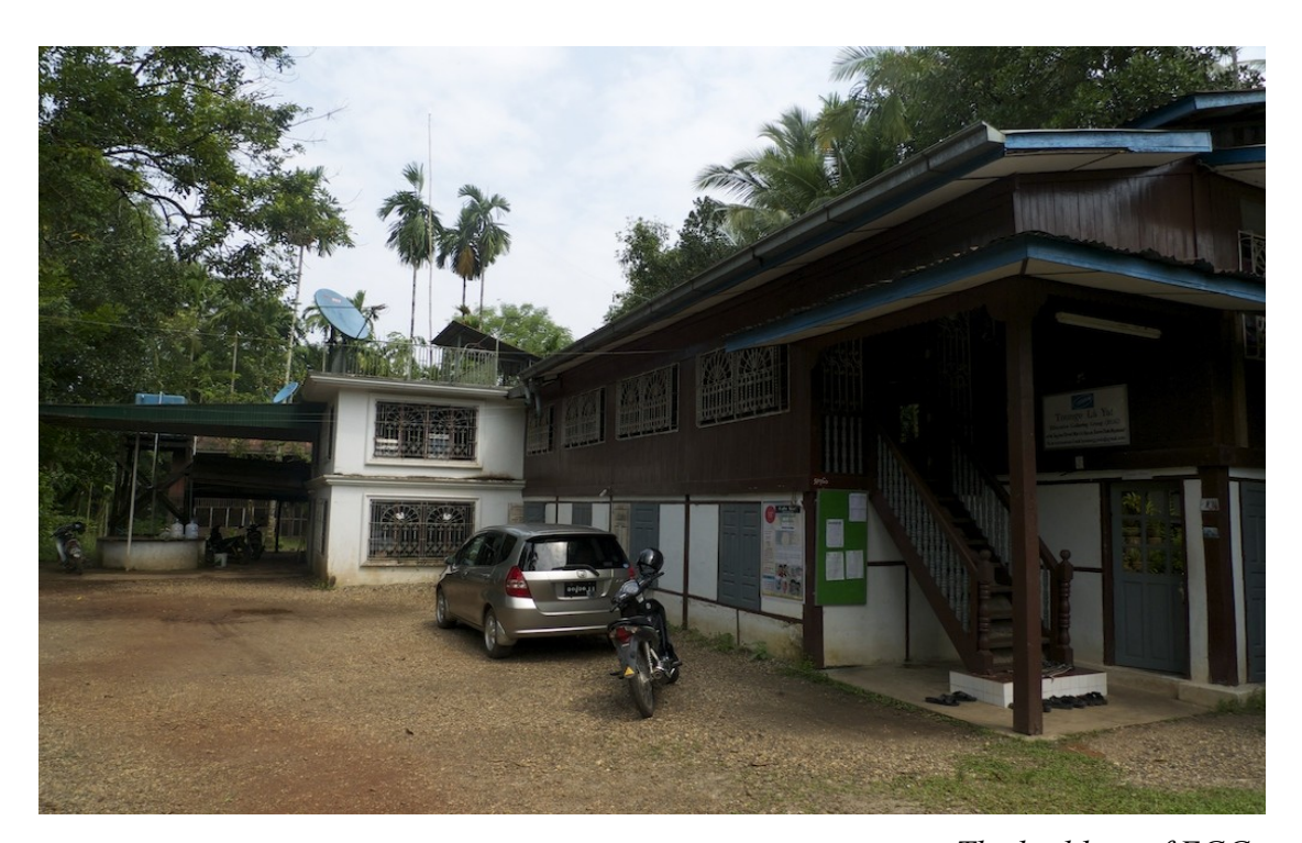
The building of EGG

The staff of the organization is rather small – at the time when we arrived, there was the principal and 3 other teachers and one administrator. However, there were also many people involved with this organization ranging from EGG alumni and board members to project coordinators of the local ADRA Myanmar office.