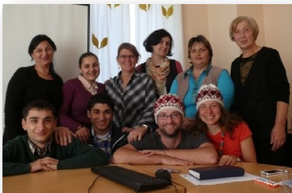
Our team 😊