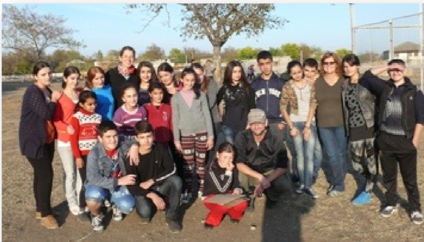
Youth club Koda CEC